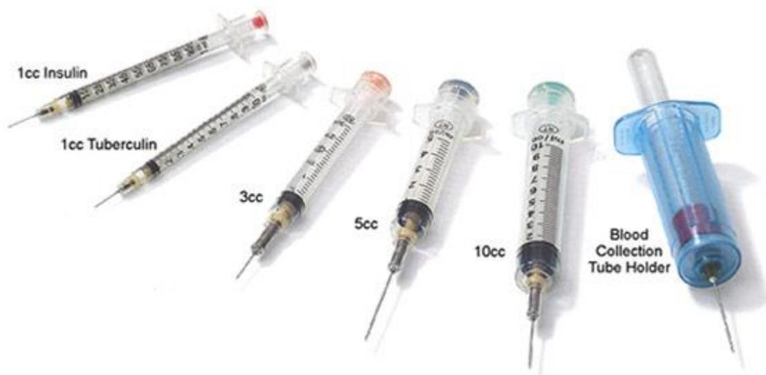
Retractable Industries VanishPoint® Blood Collection Tube Holder and Syringes