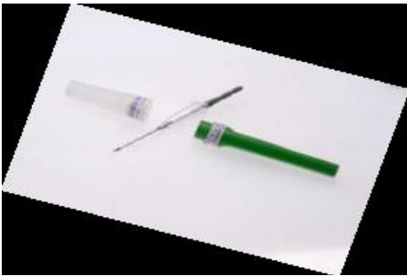
BD Flashback Vacutainer® Blood Collection Needle (EU – before-the-draw passive VEI safety) Must be used with specifically designed safety barrel