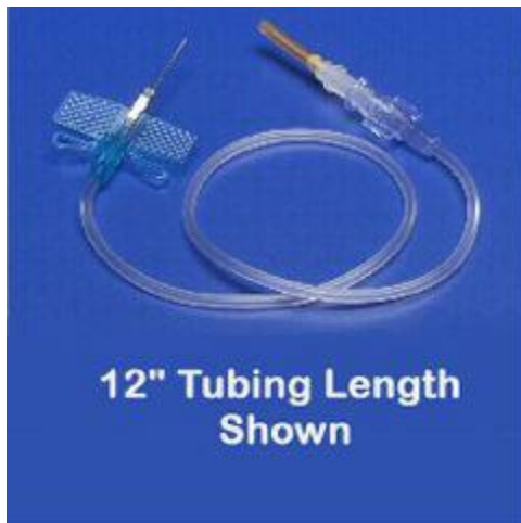
Smiths Saf-T Wing® Blood Collection Set (manually operated sliding needle cover)