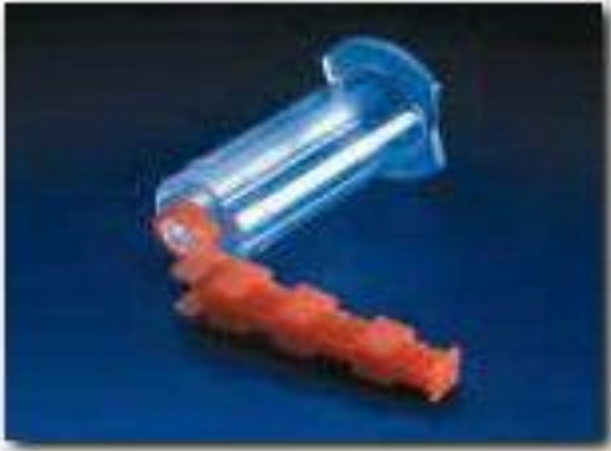
Smiths Needle-Pro® (manually operated, hinged needle capture component) Used with standard needles to provide after-the-draw safety