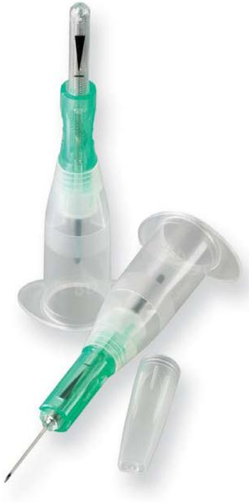
BD Vacutainer® Passive Safety Blood Collection Needle (Automatic skin activated needle cover)