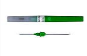
BD Vacutainer® Multiple Draw Blood Collection Needle (Standard)