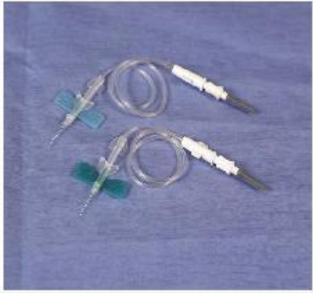
Kendall Monoject™ Angel Wing™ Blood Collection Set (manual operated sliding needle cover)