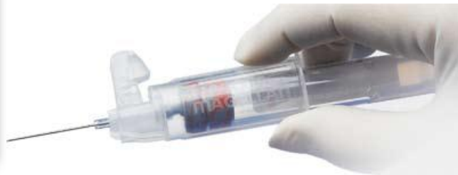
Kendall Magellan™ (very similar operation to BD)