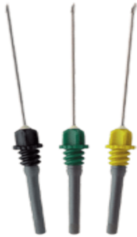
Greiner Multiple Draw Collection Needle (standard)