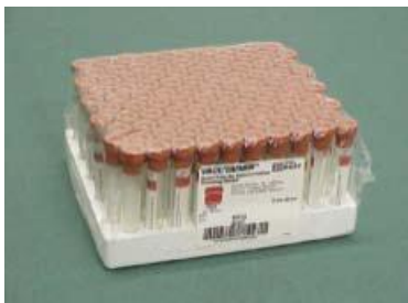
BD Red Top Blood Collection Tube (no additive) Used as a pilot tube to eliminate critical blood volume loss when using winged blood collection set