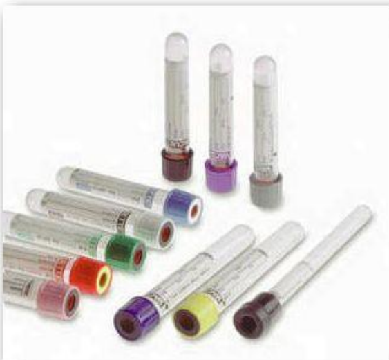
Greiner Blood Collection Tubes