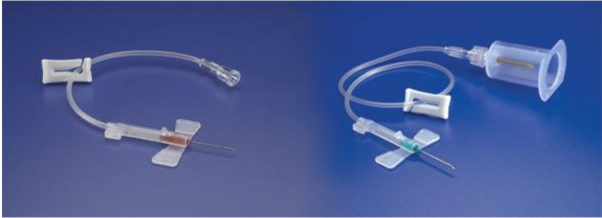
Kawasumi K-Shield® Safety Winged Blood Collection Set. (Manual operated sliding needle cover device.)