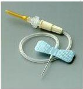
BD Winged Blood Collection Set (no safety component - used primarily for infusion)