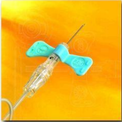
BD Pushbutton Winged Blood Collection Set (manually operated retractable needle)