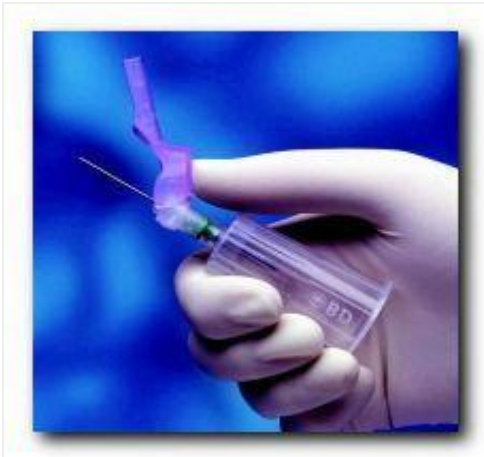
BD Eclipse™ Blood Collection Needle (manually operated hinged needle captures sharp)