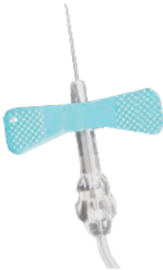
Greiner Safety Blood Collection Set (manually operated sliding needle cover)