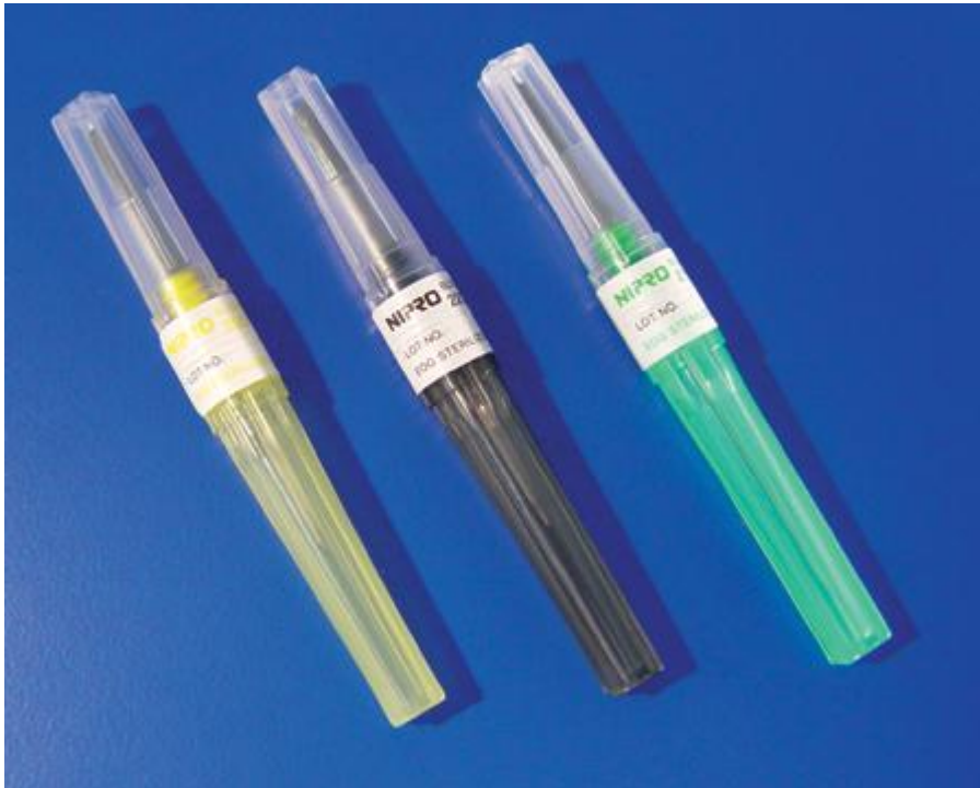
Smiths Blood Multiple Draw Collection Needle (standard)