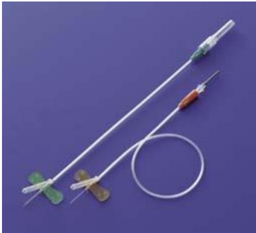
Terumo Surshield® Winged Blood Collection Set. (Manually operated, hinged needle capture device.)