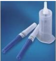
BD Multiple Sample Luer-Lok™ Adapters (used with winged collection set)