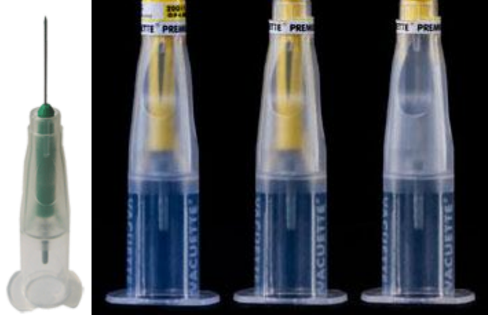
Medpro/Greiner Premium Safety Needle (skin activated; green and Tube activated; Yellow- sliding needle cover)